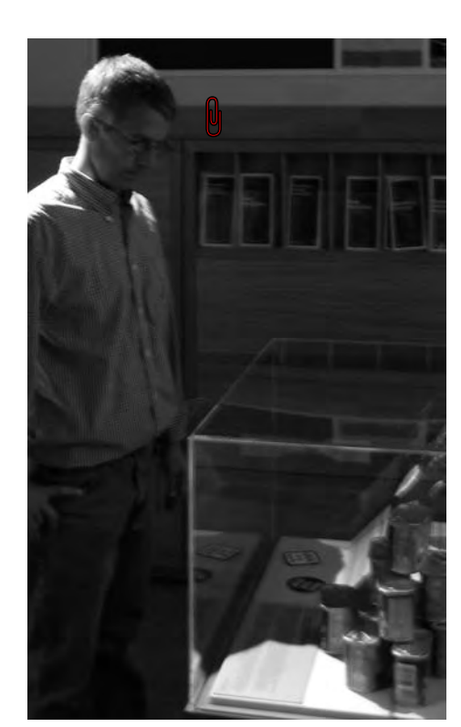
Fig. 4: When light fixtures are angled improperly, museum visitors cast shadows on the displays.

In museum lighting, the number of electrical circuits required is based on light control rather than load. Each zone should be fed by two circuits, one for artifact lighting and the other for general lighting. Those dual controls will enable you to limit light exposure for displayed artifacts and, at the same time, maintain a comfortable viewing environment for visitors.