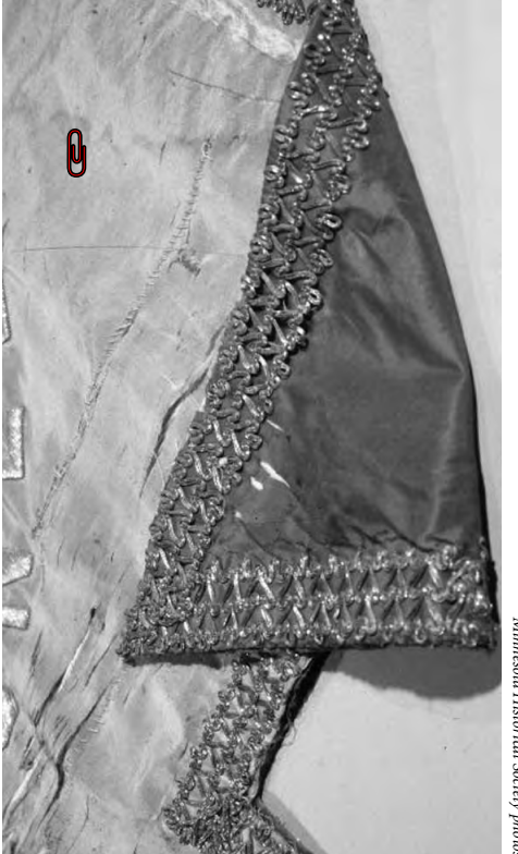
Fig. 1: A look at the back of this silk banner reveals how the front has faded from years of exposure to light.

Our challenge in museums is to use only as much light of the right type as is necessary to make exhibits comfortably visible for visitors while protecting the collections from damage. One of the most common and effective ways of lighting museum exhibits is with track lighting.