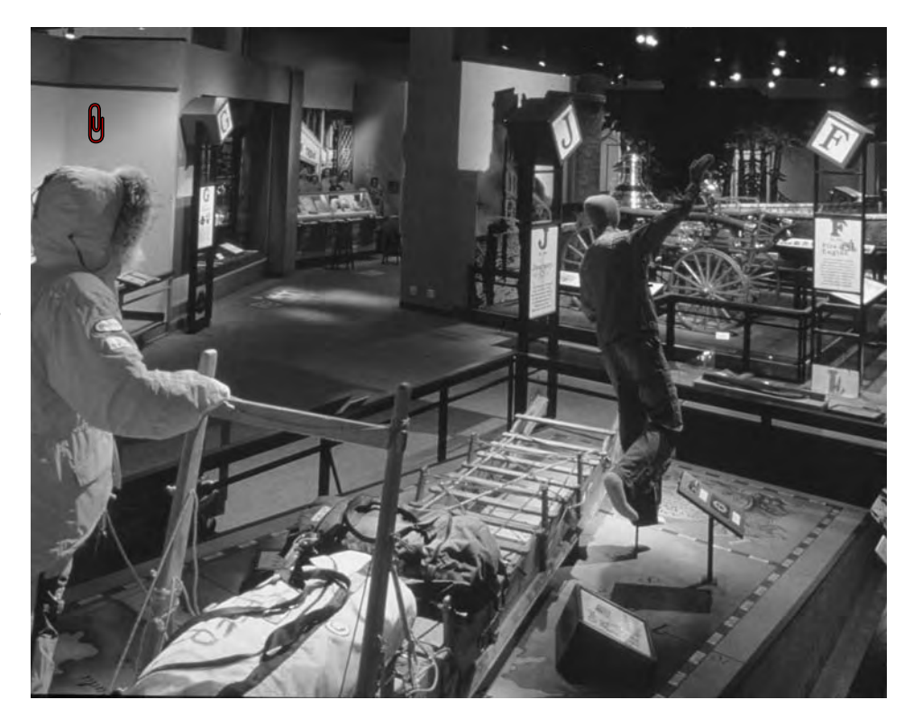
Fig. 3: Used effectively, track lighting creates visual interest by varying light levels throughout the exhibit.