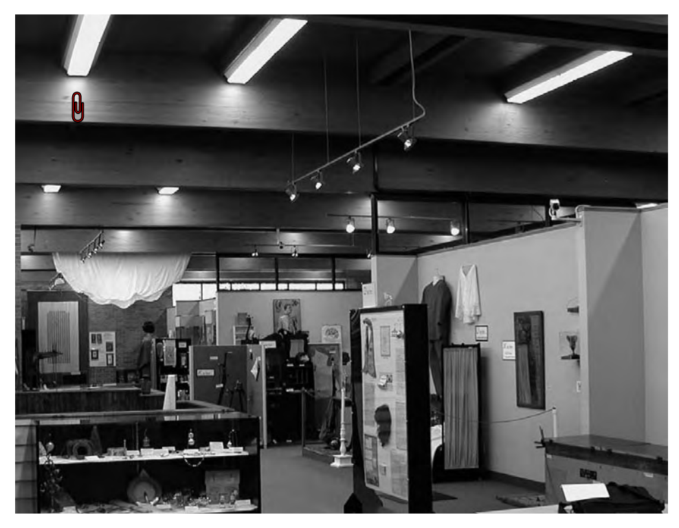
Fig. 2: Overhead fluorescent fixtures create a flat, even light. The track lighting used here provides more light but adds little visual impact.

Each manufacturer makes durable, twocircuit track and a variety of fixtures designed for long-term museum lighting. They must be special-ordered; work with a local manufacturer's representative to view samples, then arrange orders through your electrical contractor or supply house. These brands are more expensive than standard commercial track or retailgrade track, but you get the quality you pay for. For contact information, go to www.mnhs.org/techtalkresources.