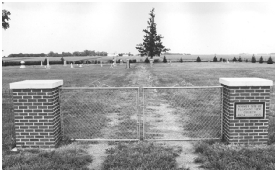
The gateway to the cemetery is on the former site of the Pleasant View Church (187–1955) in Rock County.