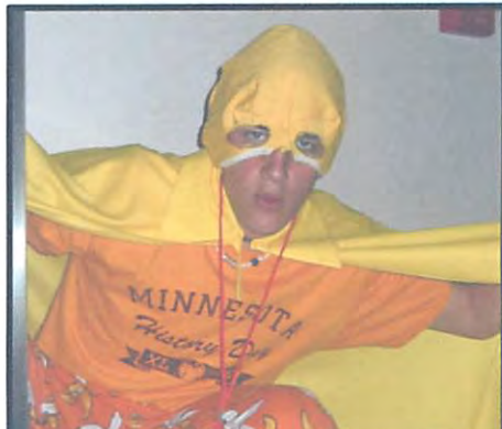
THE MASKED BANANA LEADER OF THE BUNCH