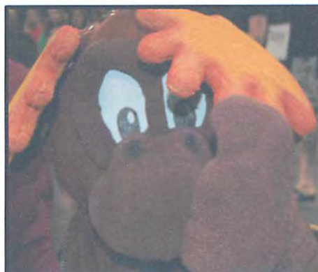
MOOSTER HISTORY WEEPY-EYED WOODLAND CREATURE