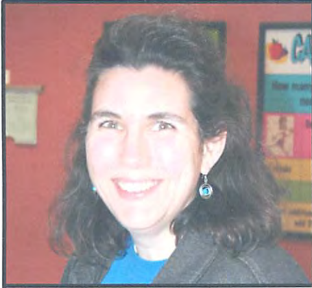
CARRIE NEWMAN MURRAY JUNIOR HIGH